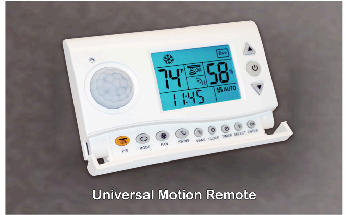
Universal Motion Remote

CETO can be set up and installed in under 5 minutes with no power or control wiring required.