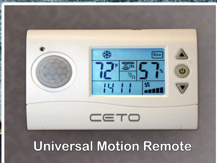
Universal Motion Remote